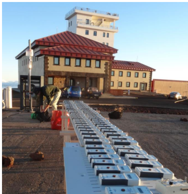
Figure 2: Calibration campaign of Calitoo instruments (TENUM) at AERONET-Europe (Izaña Observatory, Spain)